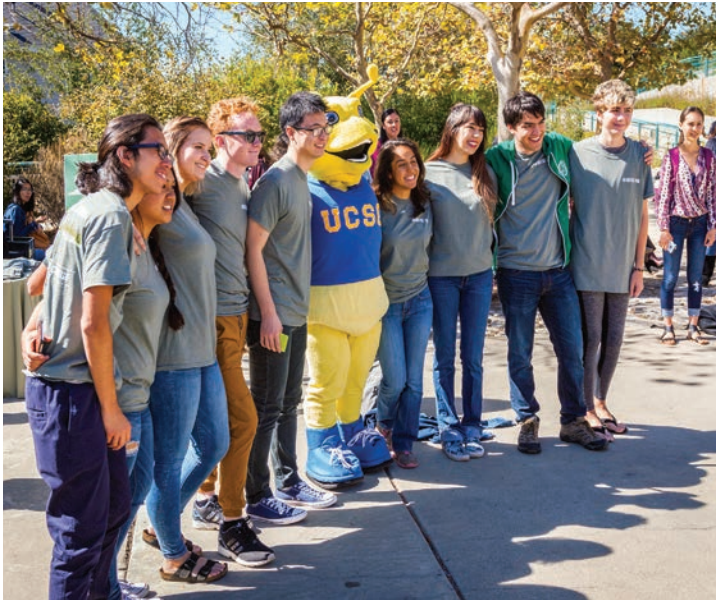
ABOVE: Students celebrate the naming of Rachel Carson College (formerly College 8).